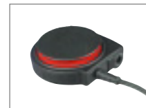
SAVOX 400 with an extra sensitive Push-To-Talk button.