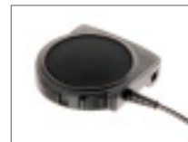
SAVOX 400 E For Peltor and SAVOX electret headsets