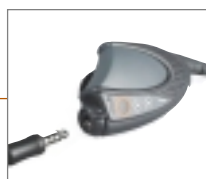
The SAVOX® C-C500 MPM Multi Purpose Remote Speaker Mic is a new type of com-unit that can be used with or without a headset.