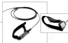
The SAVOX® R-C300 offers two alternative remote Push-To-Talk solutions, the "riot-ptt" and the "rifle-ptt".

SAVOX® is a trademark of SAVOX Communications. Doc.nr: K30284. We reserve the rights to changes 04/03.