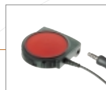
The SAVOX® C-C400 com-control/PTT unit has an extra large Push-To-Talk button that secures instant transmission in all situations.