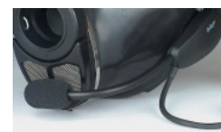
MS-Com with noise cancelling boom microphone