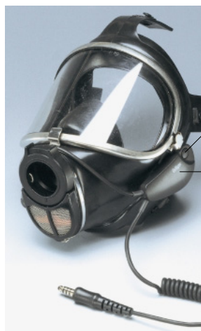
MS-Com with noise cancelling integrated microphone

The SAVOX® MS-Com complies with the EN 136 standard.